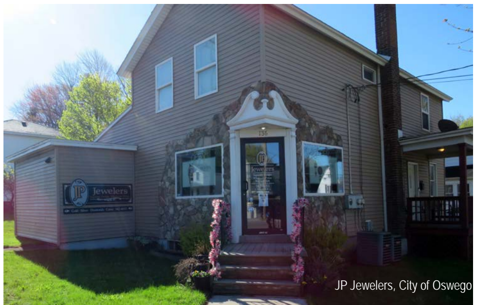
JP Jewelers, City of Oswego

cities, towns & villages across Oswego County assisted