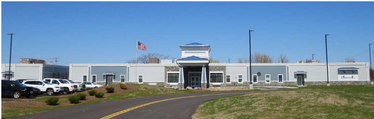
Lakeview Center for Mental Health and Wellness, City of Oswego

Oswego Health's Lakeview Center for Mental Health and Wellness, in the City of Oswego, opened after 13 months of construction. The property, on which the new facility was constructed, used to be home to the former Price Chopper and was acquired from the COIDA. The 40,000 sf Center is anticipated to employ 35 to 40 people, in addition to a full-time nurse practitioner. The $17 million project converted a vacant building into a modern mental health facility that includes outpatient care, primary care and other specialty services, in addition to a 32-bed inpatient unit.