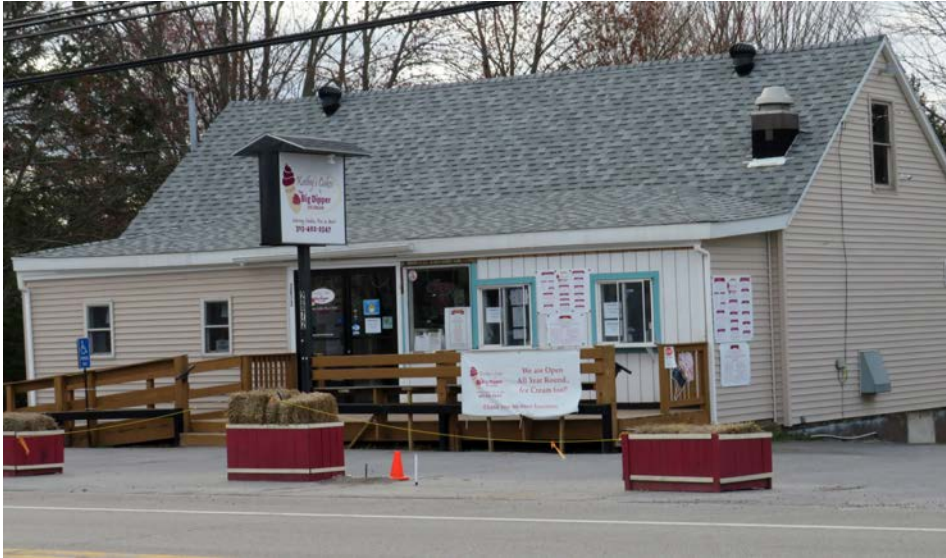
Kathy's Cakes & Big Dipper, Town of Volney

"Operation Oswego County has also been there when the business needed it the most. Just a couple short months after spending all our resources to remodel and relocate to a new property, the COVID-19 pandemic hit and business was uncertain to say the least. They were able to provide a temporary $10,000 loan so the business could continue to operate."