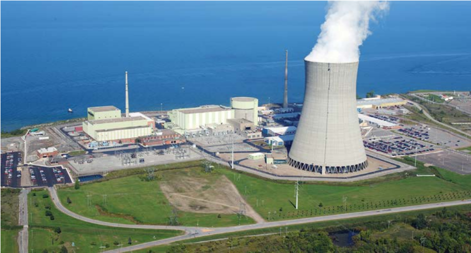
Nine Mile Point Nuclear Station, Scriba, NY

Nine Mile Point Nuclear Station, LLC and the COIDA entered into a Straight Lease Transaction that, over a 5 year period, will generate $152 million in PILOT payments for the Town of Scriba, Oswego City School District and the County of Oswego.