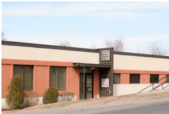
Business Expansion Center, Oswego, NY