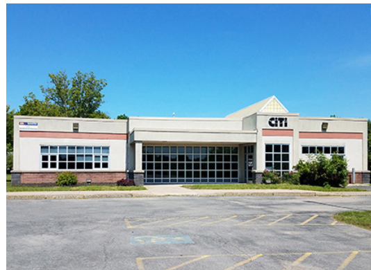
CiTi, Schroepfel, NY