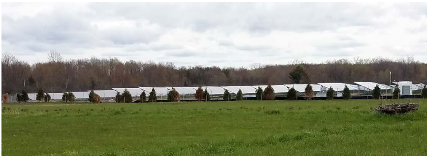
Howland Solar, Sandy Creek, NY (solar project similar to projects in progress)

COIDA/OOC Loan Deferrals Initiative was authorized to help address the pandemic's impact on businesses with outstanding loans through OOC and the COIDA. A deferment of interest and principal payments until October 1, 2020 was provided to 25 businesses for loans totaling $2,144,000 with monthly payments of $33,675.