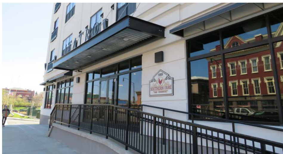
Southern Fare, Oswego, NY

ASA Volney NY Solar, LLC is a 5 MW solar renewable energy project that will be located on a 25 acre site in the Town of Volney. The project investment will be $9.1 million. The developer, Omni Navitas, is based in Boston, MA.