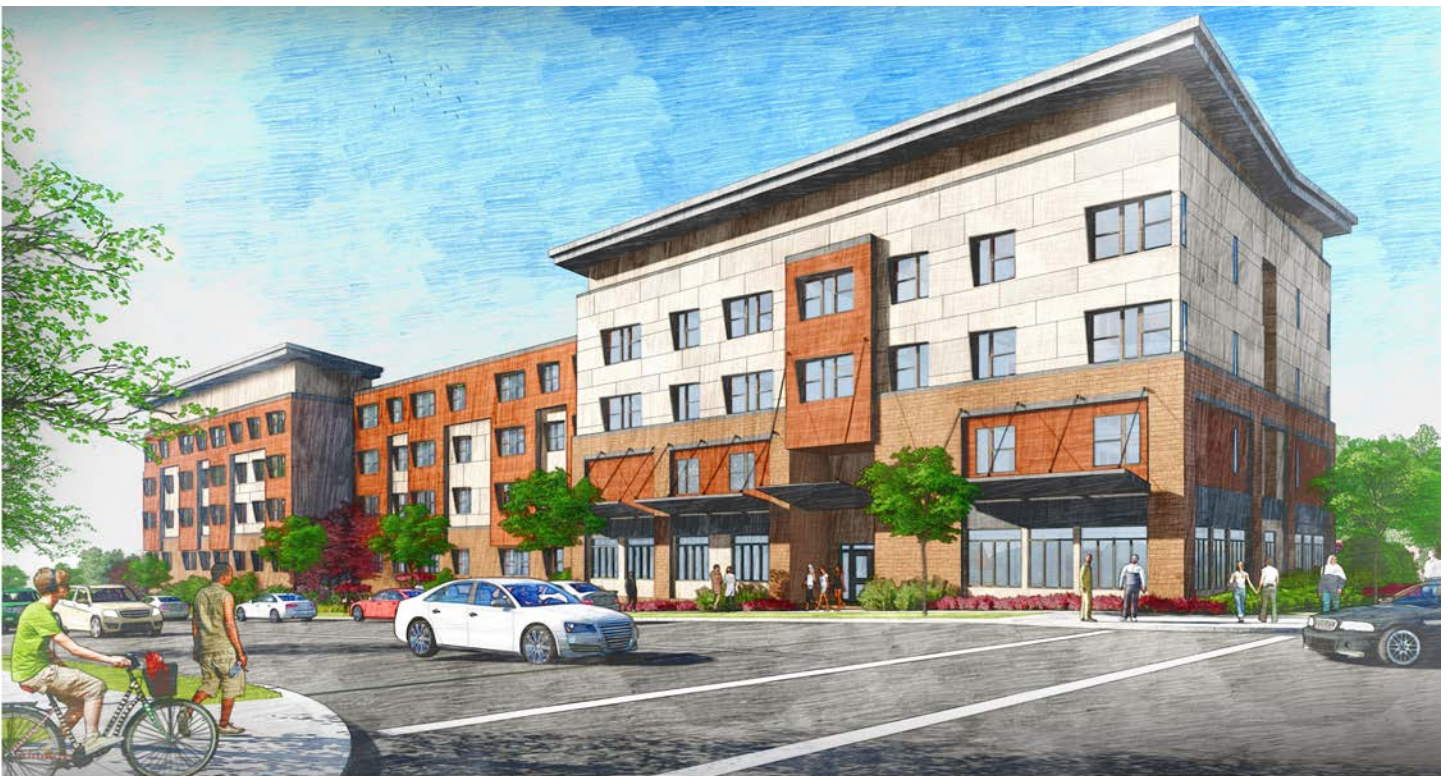
DePaul Lock 7, City of Oswego

Omni Navitas, LLC , based in Boston, MA, is constructing two solar renewable energy projects on Route 41 in the Town of Richland. One is a 3.75 MW project on 26 acres with an investment of $6.76 million. The second is a 3.875 MW project on 26 acres with an investment of $6.97 million. Financial assistance will be provided by the COIDA.