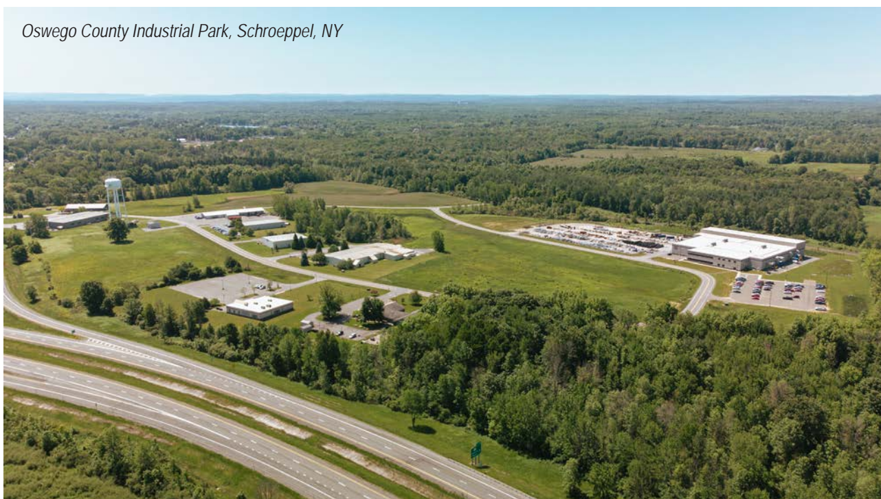
Oswego County Industrial Park, Schroepfel, NY