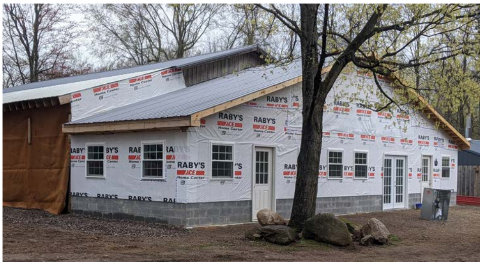
Maple Hollow Farm, Hannibal, NY

Pond Pit, LLC includes the acquisition of equipment, a 2,050 sf restaurant/bar and 5.5 acres in the Town of Sandy Creek. The new Pond Pit BBQ restaurant will be casual and will include bar service. The $199,000 project will create 4 jobs. The business will be a year-round operation. Financial assistance was provided by the COIDA.