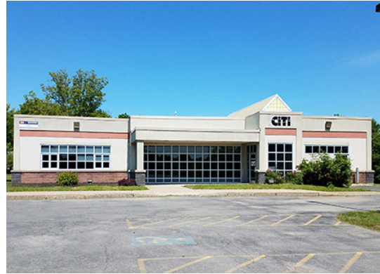
CiTi, Schroepfel, NY