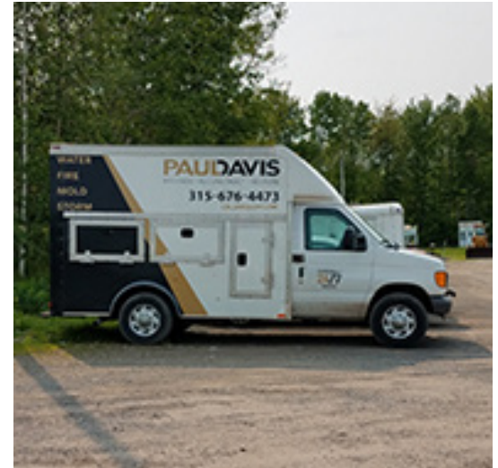
North Country EPS, Town of Hastings

Northland Filter International acquired a 32,500 sf building on a 6 acre site at the Lake Ontario Industrial Park in the City of Oswego. The company has been leasing the facility since 2004. The $4.2 million project will also include a 15,000 sf expansion. The company manufactures air filtration products. The project will retain 26 and create 40 jobs. Financial assistance was provided by OOC, COIDA and Oswego CEDO.