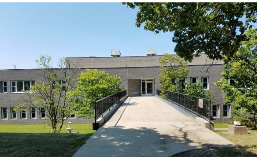
The Maples Assisted Living, City of Fulton

North Country EPS expanded its business located in the Town of Hastings. The company delivers rapid response services to fire, water, storm and other emergencies, offering restoration and reconstruction services. The company is also a licensed mold mitigation and an EPA certified lead paint remediation firm. The $70,000 expansion will create 12 and retain 19 jobs for the firm. Financial assistance was provided by Solvay Bank and the COIDA. This is a veteran-owned business and a franchise of Paul Davis Restoration. They've been in business since 2011.