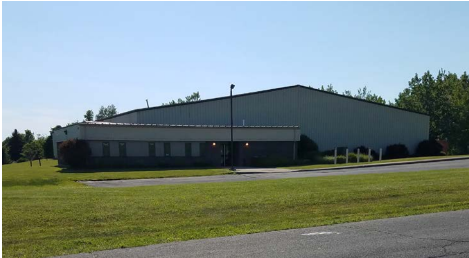
Northland Filter International, Oswego, NY