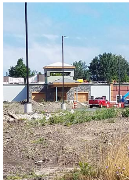
Oswego Health Behavioral Health Services City of Oswego