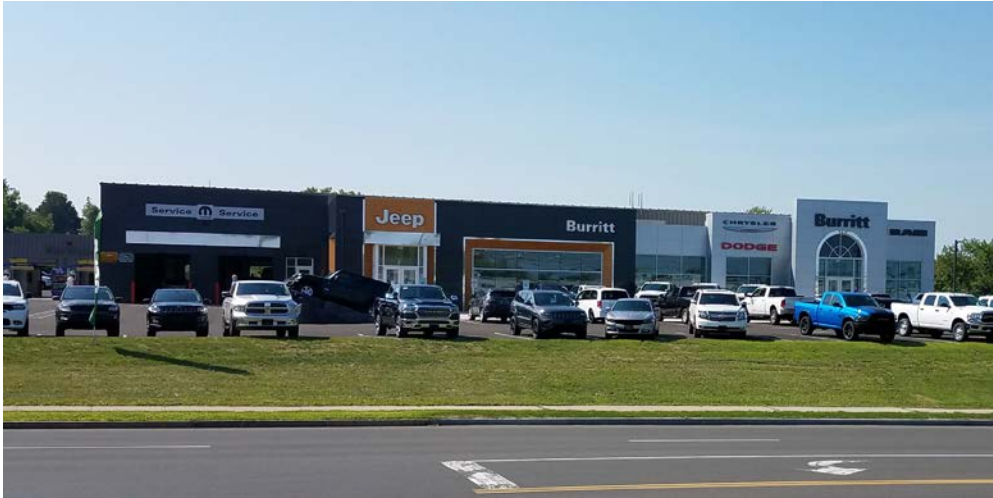
R.M. Burritt Motors, City of Oswego

22 Crossroads is the development of a mixed-use project in the City of Oswego that involves 44,000 sf with 32 apartments and 5,000 sf of commercial space in a 4-story facility. The $6.9 million project was part of the Oswego Downtown Revitalization Initiative. Financial assistance is being provided by Pathfinder Bank, ESDC, Oswego DRI and the COIDA.