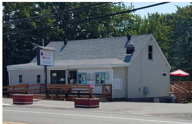
Kathy's Cakes & The Big Dipper Ice Cream, Town of Volney