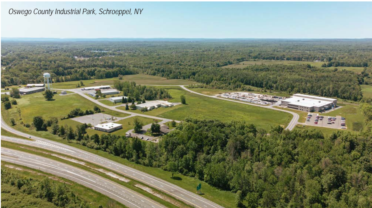
Oswego County Industrial Park, Schroepfel, NY