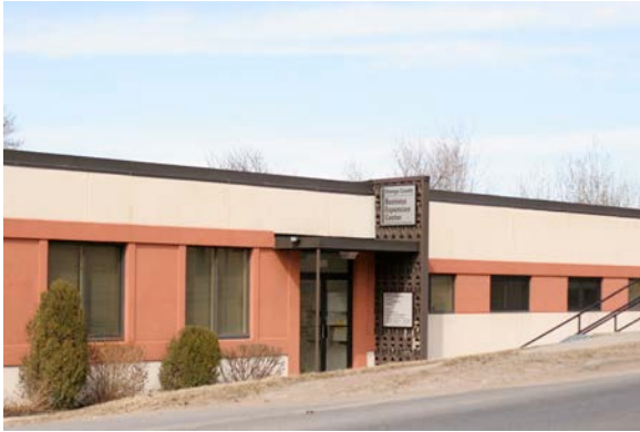
Business Expansion Center, Oswego, NY