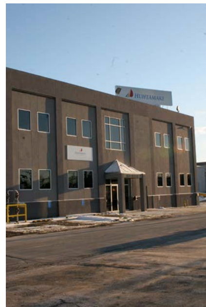
Huhtamaki, City of Fulton