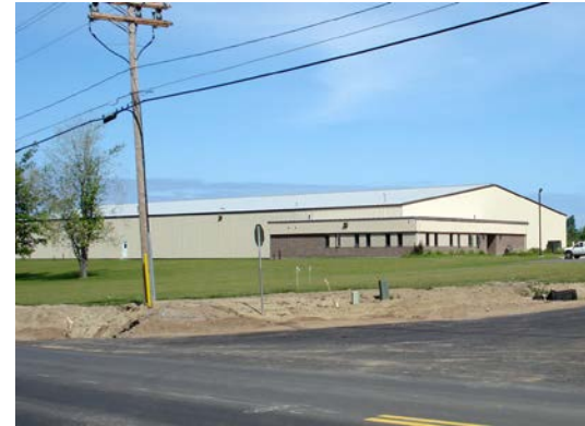
Oswego Spec. Building, Oswego, NY