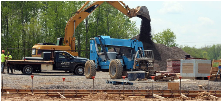
EJ USA, Inc., Schroepfel, NY

EJ USA, Inc. , is constructing a new 71,300 sf manufacturing facility on a 15 acre site in the Oswego County Industrial Park in the Town of Schroepfel. The facility will be used as a steel and aluminum fabrication plant and a distribution center for infrastructure access solutions products such as manhole frames, grates, covers, hatches, etc. The company is based in East Jordan, MI. The $9.1 million plant will employ 91. Financial assistance being provided by the COIDA and ESDC.