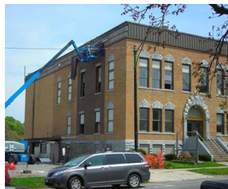
Camelot YMCA, Oswego, NY

Oswego Health Behavioral Health Services , an agreement was entered into with the COIDA to acquire the former Price Chopper property in the City of Oswego to relocate and expand behavioral health services. A $13 million state grant has been awarded for the project. It is estimated that 80 jobs would transfer from the current Bunner Street location and 25 new jobs would be created.