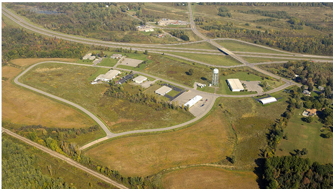
Oswego County Industrial Park, Schroepfel, NY