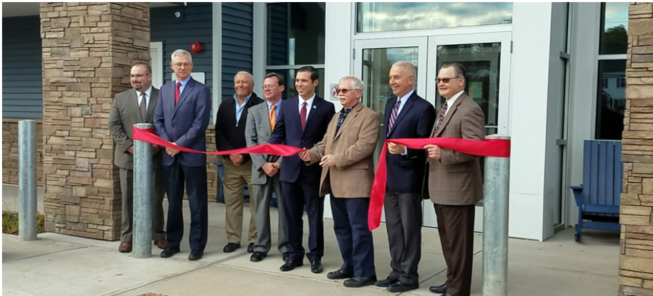
Lakeside Commons, Town of Oswego, NY