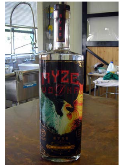
Lock 1 Distilling Co., Phoenix, NY

Oswego YMCA , in the City of Oswego, was awarded funding from ESDC/CNY REDC to help support the development of the $750,000 pool connector project.