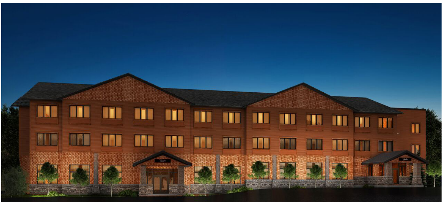
Tailwater Lodge, Albion, NY

Lakeside Commons, LLC , a new market rate student housing complex located in the Town of Oswego. The $22.2 million investment to include 11 residential buildings containing 84 units (320 bedrooms), a 9,000 sf clubhouse, surface parking for 240 cars and is located adjacent to the SUNY Oswego campus. Project to create 8 jobs and 200 construction jobs. Financial assistance provided by NBT Bank and COIDA.