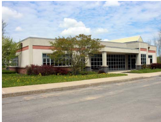
CiTi, Schroepfel, NY