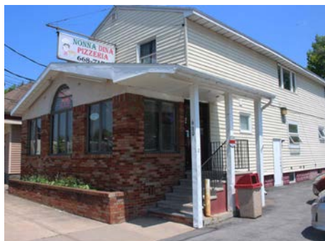
Nonna Dina Pizzeria, Central Square, NY

Community Bank Fulton Savings Bank NBT Bank Pathfinder Bank