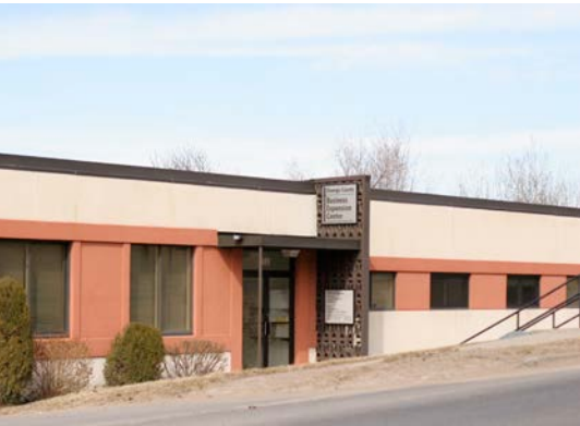
Business Expansion Center, Oswego, NY