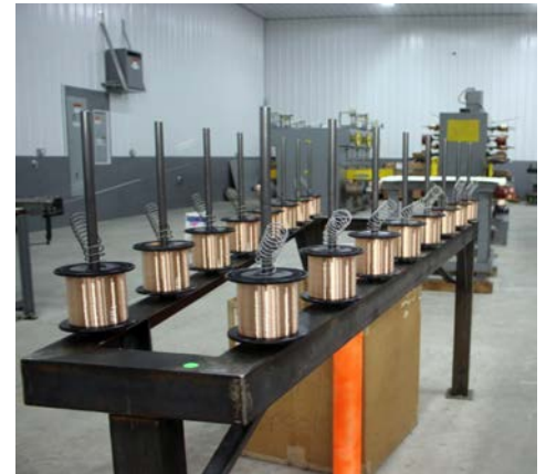
United Wire Technologies, Constantia, NY

Tailwater Lodge , in the Town of Albion, will be expanding with a new 24,000 sf three-story addition that will house 46 rooms, a spa, pool and exercise facilities. Capacity will increase over 100% to 88 rooms for the destination complex that is affiliated with the Hilton Tapestry Collection. The $2.5 million investment will create 35 jobs. Financial assistance was provided by Pathfinder Bank and the COIDA.