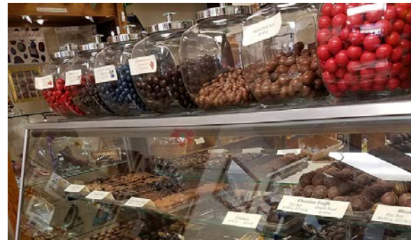
Man in the Moon Candies, Oswego, NY