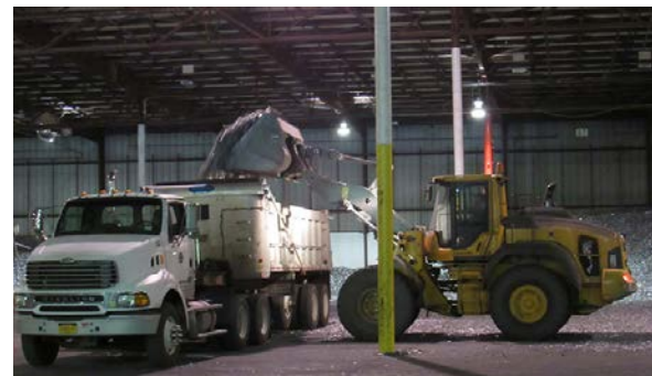
Doty Contracting, Volney, NY