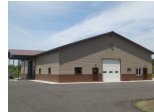
Bardy's 4 Seasons Tire & Auto, Sandy Creek

What this means for you: When you apply for a SBA 504 loan, we will ask for your name, address, date of birth, and other information that will allow us to identify you. We may also ask to see your driver's license or other identifying documents.