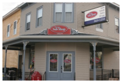
Oswego Sub Shop, Oswego

OOC is authorized to finance projects using the SBA 504 loan program which is designed to promote economic development growth and job creation in small