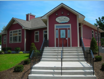
River House Restaurant, Pulaski

*2014 SBA Small Business Excellence Award recipient