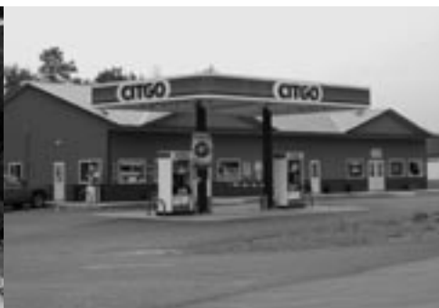
Old Man's Place is a new 4,800 sq. ft. convenience store in Granby.