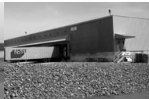
Huhtamaki Consumer Packaging completed its warehouse optimization expansion.