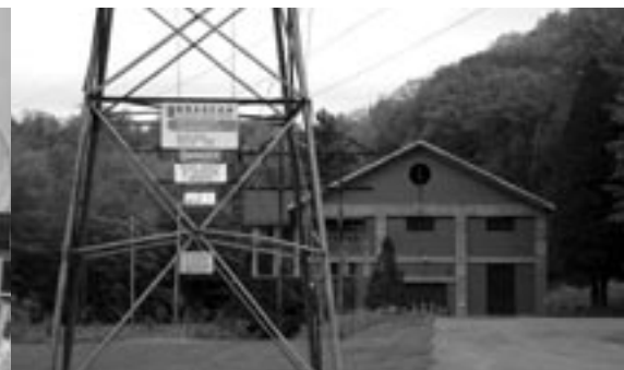
Brascan Power will make capital improvements at its plants in the town of Orwell.