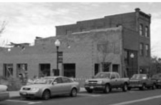
Lower Falls Development is renovating the historic Brickhouse Building in Fulton.