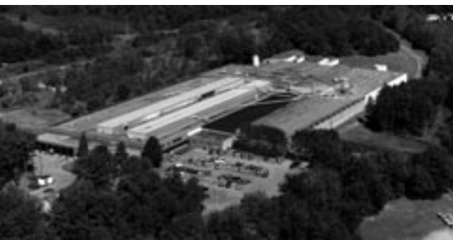
Precision Wood Flooring acquired the former Jefferson-Smurfit plant in Volney.

Additionally, one of OOC's key goals last year was to promote the Oswego County Public Utility Service's "Power for Progress" low-cost electrical energy program for new and expanding businesses in Oswego County. The purpose of the program is to create jobs using low-cost electricity produced by Entergy Nuclear Northeast at the James A. FitzPatrick Nuclear Power Plant in Scriba. In 2005, 12 companies were awarded over 1.8 megawatts of discounted power. OCPUS will continue to allocate up to 10 megawatts of low-cost power at $32 per megawatt-hour per year until 2010.