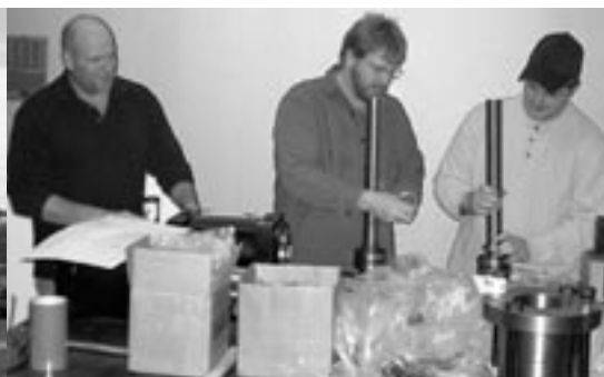
Fulton Machinery located to OOC's Start-Up Facility.